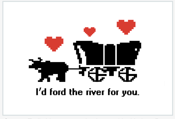
Oregon Trail video game valentine card by Lindsay Raven

Happy Valentine's Day to those who celebrate. We're excited to see you in person or online at our upcoming events: