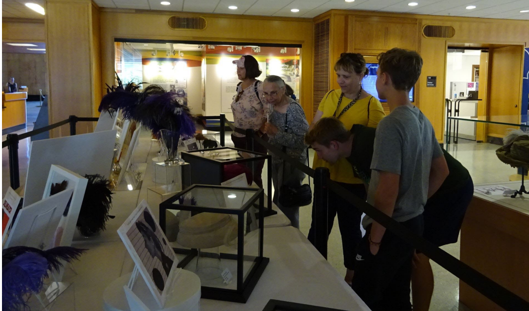
Past Capitol History Gateway exhibit

The Capitol History Gateway Exhibit Sponsorship Program supports Oregon-based public and nonprofit museums and organizations to produce an exhibit that meets one or both of the following goals: 1) Increase participation in Oregon's democracy, 2) Increase interest in Oregon's history, and especially in the history of government. Awards range between $200-$5,000. Deadline is January 31, 2022.