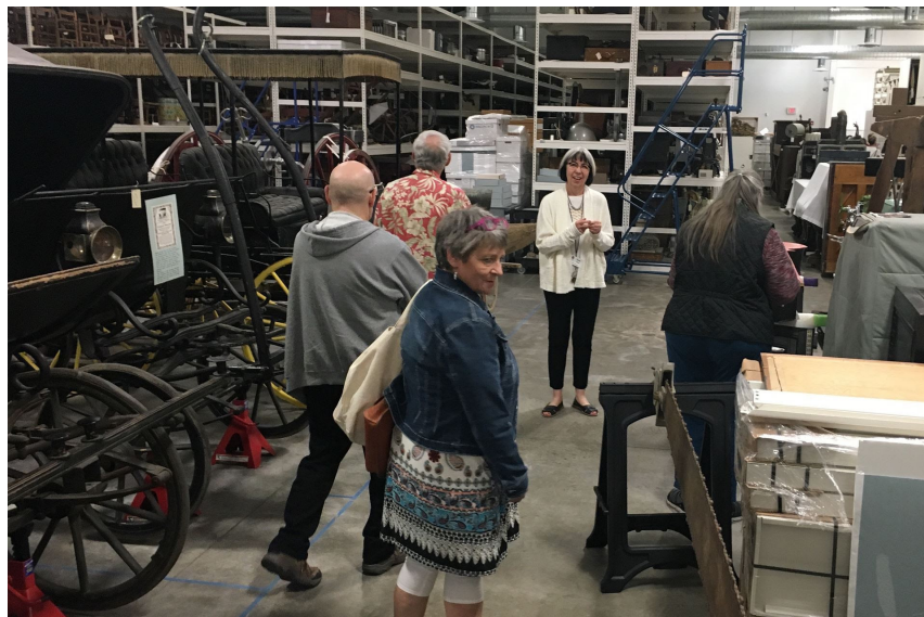
Photo: OMA 2019 Spring Workshop, Benton County Museum