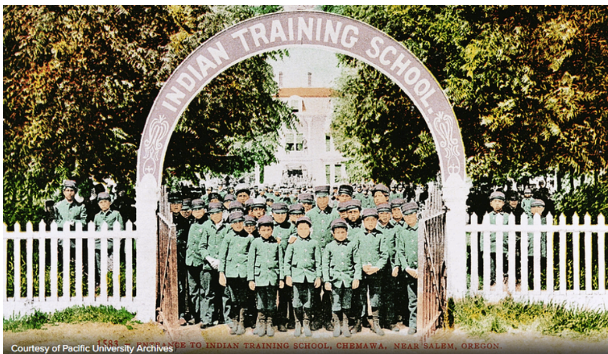
Photo: Students posing at Chemawa Indian Training School, near Salem, OR. Pacific University Archives