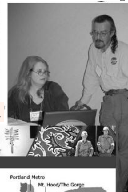
Organizational Members learn about website access and updating during the spring meeting.

New Member Pages! As a result of upgraded benefits, Member Organizations can now market themselves on the Oregon Museums Association website. Based upon the popular Guide to Oregon Museums , the user-friendly site provides the ability to update & edit webpage information, link to home websites and attract visitors!